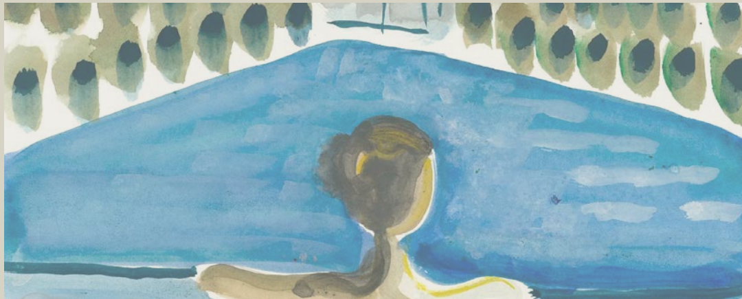
Inspired by the lake, watercolour by Matteo Thun

"Capturing the spirit of Lake Louise was at the heart of the architectural intention, to respect the richness of the landscape with a design that represents simplicity, purity, and the uniqueness of the location. Nature and the beautiful surroundings of the lake and the forest become the protagonist – architecture and interior design the stage," says Thun.