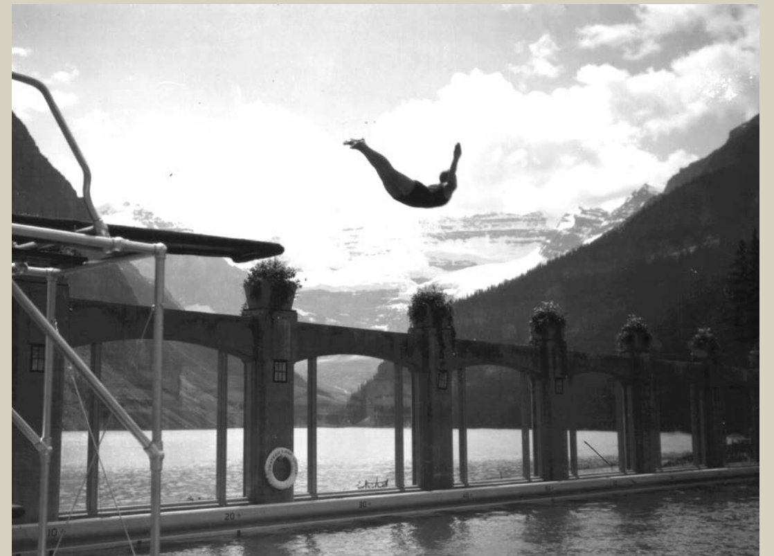
NA71-4910 Open-air swimming pool on the shores of Lake Louise

In 2025, the luxury of lakeside bathing returns to Chateau Lake Louise, with the introduction of BASIN Glacial Waters. Resting on the exact location of the original open-air pool, BASIN represents the contemporary redesign of the outdoor bath experience, imagined for the modern-day wellness seeker.